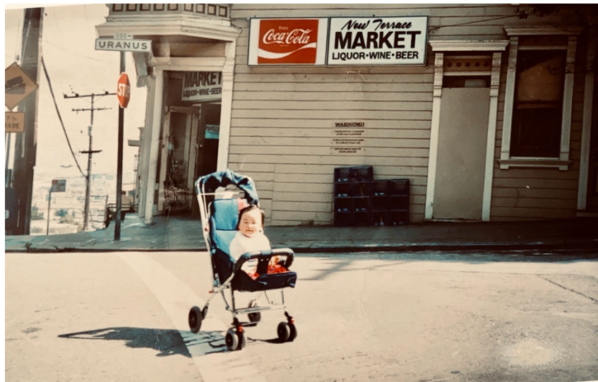
1988